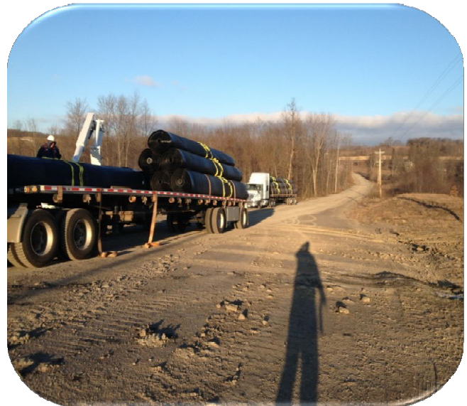
Trucks Staged for Unloading