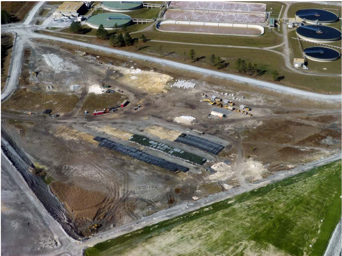
Aerial Photo of 72 Acre Turf & Geomembrane Laydown Area