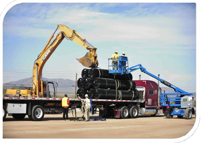
Removal of Geomembrane