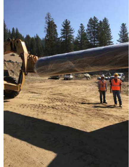
Removal of Turf from Box Trailer