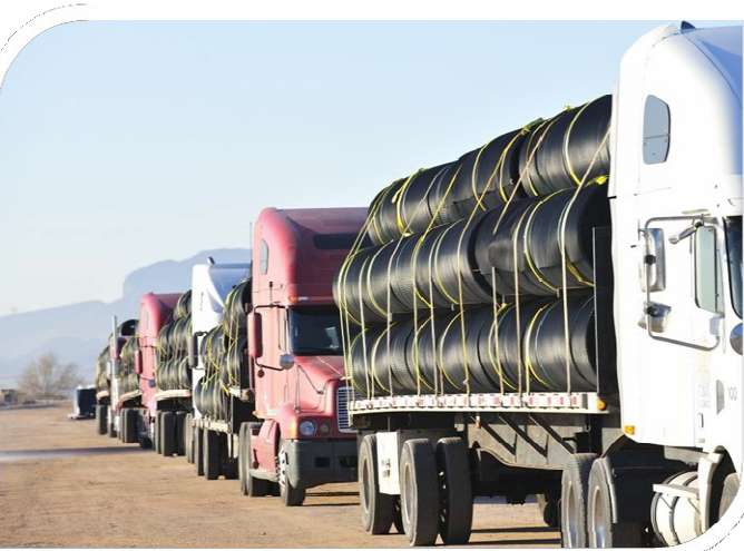
Geomembrane on Flat Bed Semi