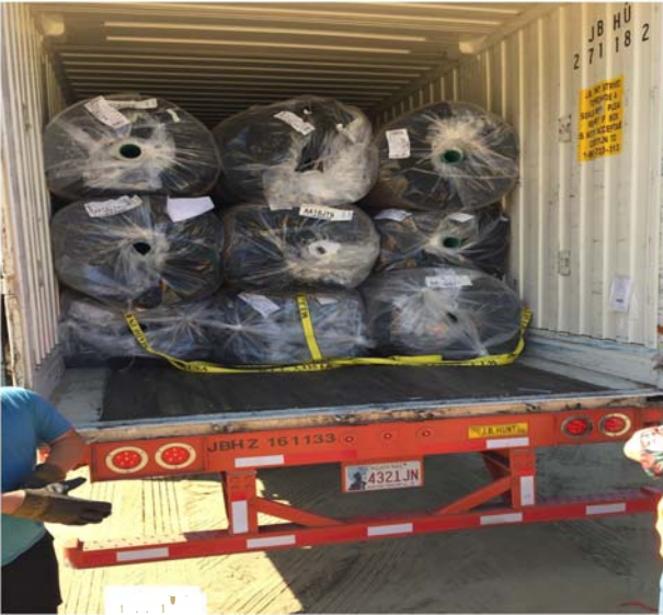
Box Trailer w/ Turf Rows