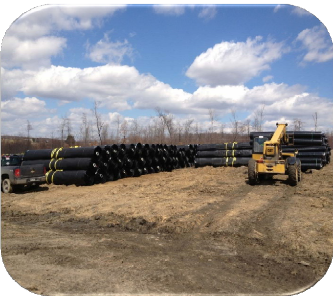
Placement of Geomembrane