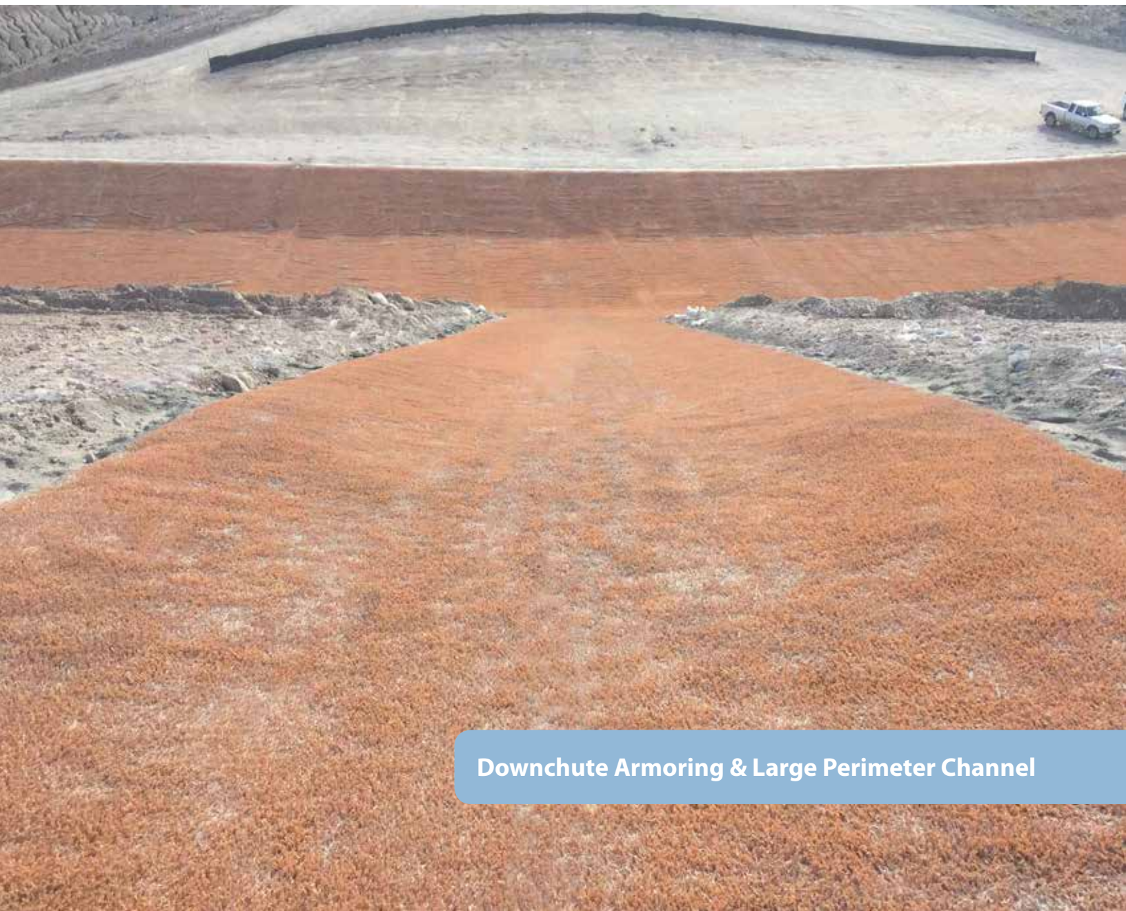
Downchute Armoring & Large Perimeter Channel

HydroTurf® offers rapid, low impact installation that's significantly less costly than hard armor and piping, and it is projected to last more than 50 years when properly maintained. The system also provides many environment benefits. By effectively filtering surface water, the end result is clean runoff with very low turbidity. In addition, it significantly reduces sediment loading in channels and sedimentation/detention basins both on and offsite. By offering superior erosion control, pointedly less turbidity and significantly less maintenance, HydroTurf provides a superior solution for landfill storm water management systems over traditional methods.