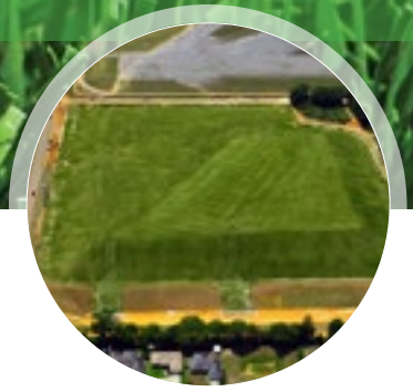
Saufley Field Landfill