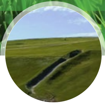
Louisa County Landfill