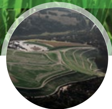
Crazy Horse Landfill