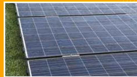
Adjustable Mounting System