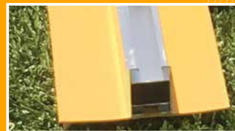
Embedded Rail Attachment