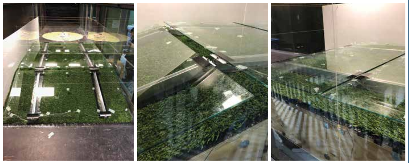
Wind Tunnel testing of ClosureTurf ® and PowerCap ™